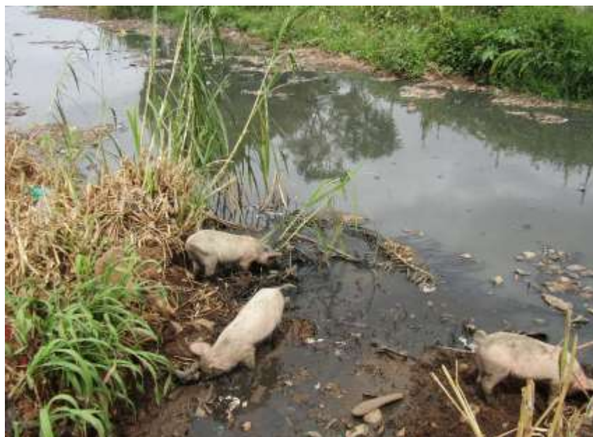
Figure 1. Section of study site in Kibera settlement.

heavy metals (Ndeda and Manohar, 2014) and pesticides (Wandiga, 2001). These pollutants have been suspected to be containing endocrine disrupting compounds (EDC) with a potential to disrupt the endocrine function (Falconer et al., 2006), and also cause reproductive problems (Mendes, 2002).