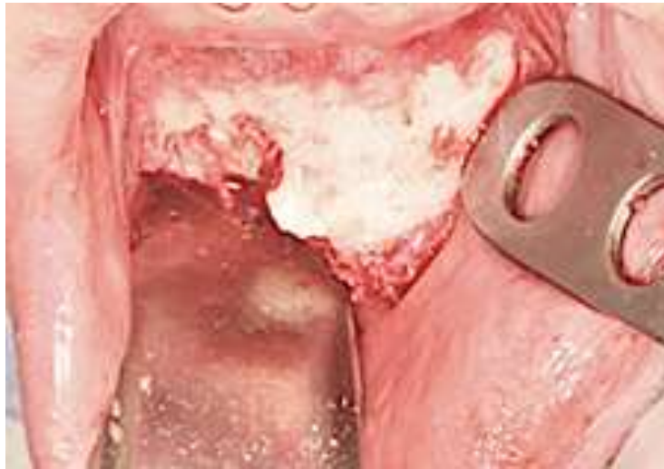
Plate 5. Fragile and brittle bone.