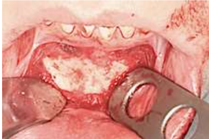
Plate 3. Exposure of the bone area, for canine removal.