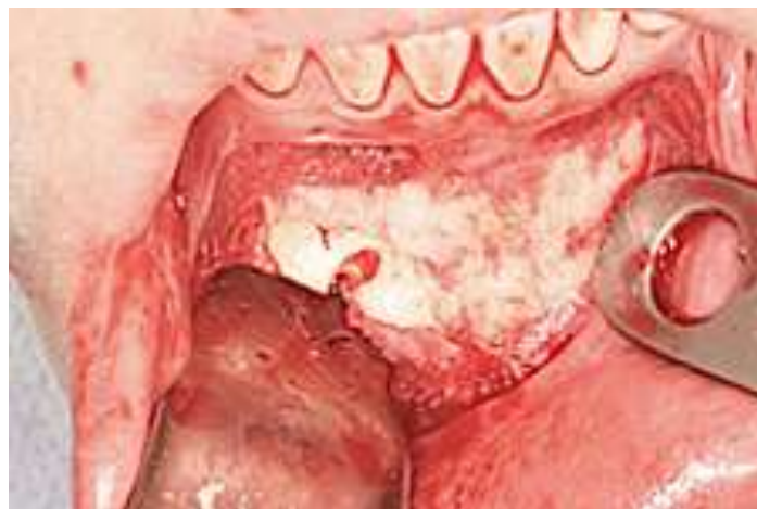
Plate 4. Exposure of the bone area, for canine removal.