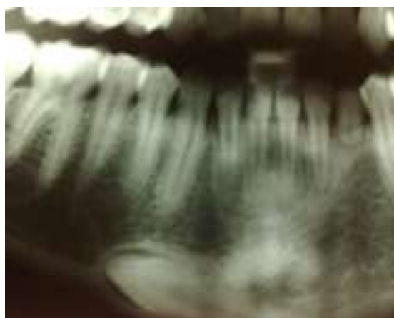
Plate 2. Orthopantomography of the patient, canine in a region near the mentum.

in the choice of surgical treatment (Curl and Boyle, 2012). Nitrous oxide is one of the forms of sedation of patients who undergo procedures in the odontological office. However, it has one of its weak points its weak action potency, most of the time being additional sedatives. In treatments in children in the dental outpatient clinic, drugs such as sevoflurane by inhalation route are showing efficacy in short and half-time dental procedures (Santos et al., 2017). Nitrous oxide presents some contraindications, among them, it is absolutely impossible to use in patients who underwent vitreoretinal surgery, where it will have an accumulation of intraocular gases. Thus, it is extremely important to know the dental surgeons' knowledge about this type of procedure in these risk patients. The communication with the patient's ophthalmologist is of utmost importance not to present postoperative complications (Lau et al., 2013). This paper aims to expose, through the report of a clinical case the clinical characteristics and treatment approach in an unusual pathology of an impacted lower canine.