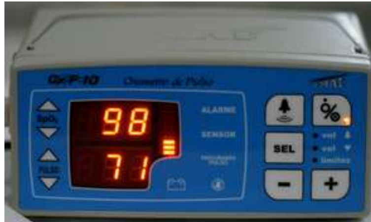
Plate 8. Pulse oximeter.