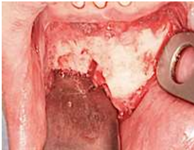
Plate 6. Fragile and brittle bone.