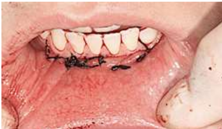
Plate 7. Suture after canine removal.