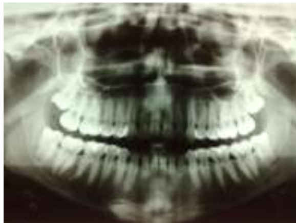
Plate 1. Orthopantomography of the patient, canine in a region near the mentum.